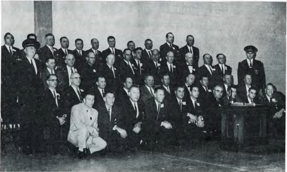
DeMolay Commandery No. 3, Lexington, Missouri Knights 43 Candidates

the Grand Chapter and two are Past Grand Commanders of the Grand Commandery.