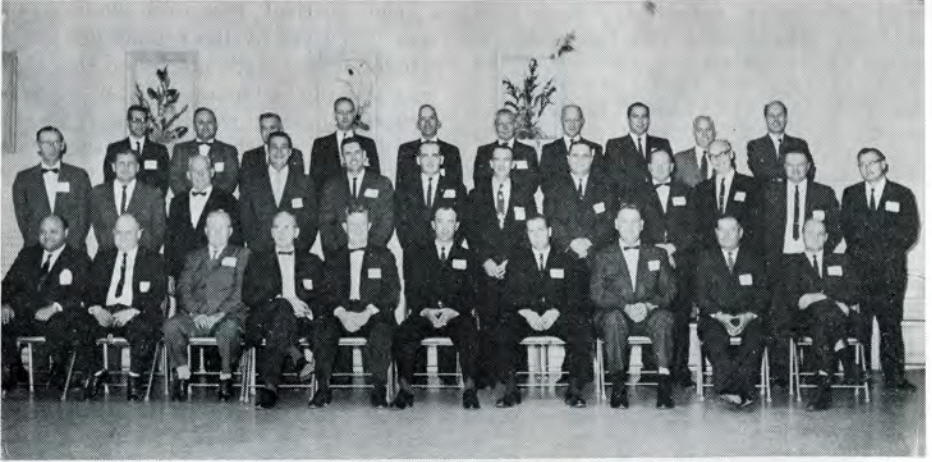
Luray Commandery No. 19 Knights 32 Candidates

in the Elementary School building and was honored by 125 Sir Knights from twelve Commanderies in the northwestern part of the state, including thirty-two (32) candidates.