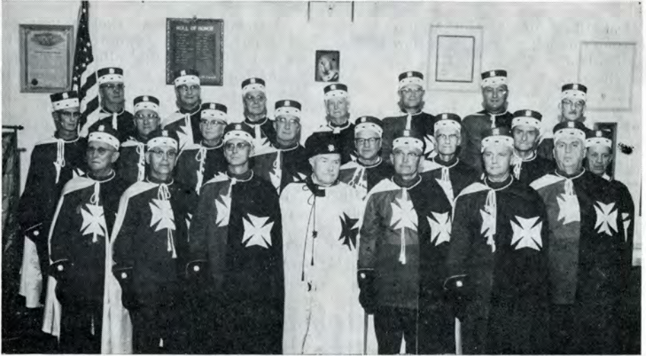
Red Cross Team of Springtime Commandery