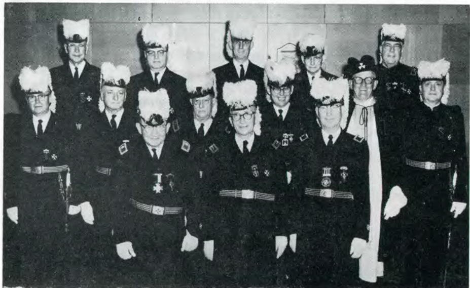
CUYAHOGA FALLS COMMANDERY (OHIO) ON THE MARCH