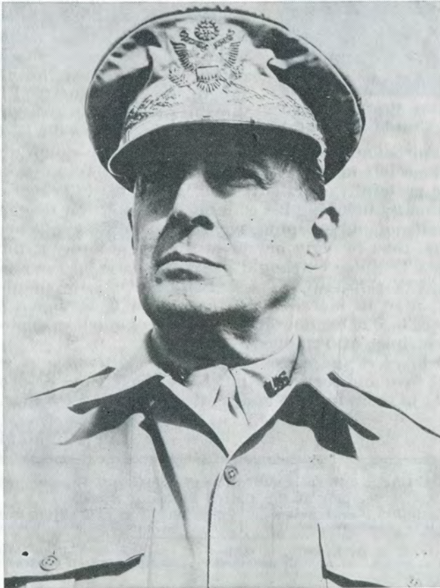
General Douglas MacArthur

SPECIAL ISSUE - PROMOTING PATRIOTIC ACTIVITIES