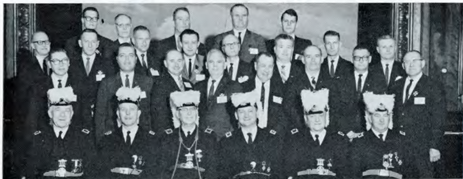
Alliance Commandery No. 67 (Ohio) Spring Reunion Class Honoring 50th Anniversary Alliance Council No. 112 R. & S.M.