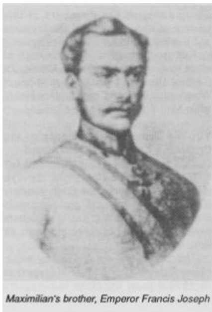
Maximilian's brother, Emperor Francis Joseph