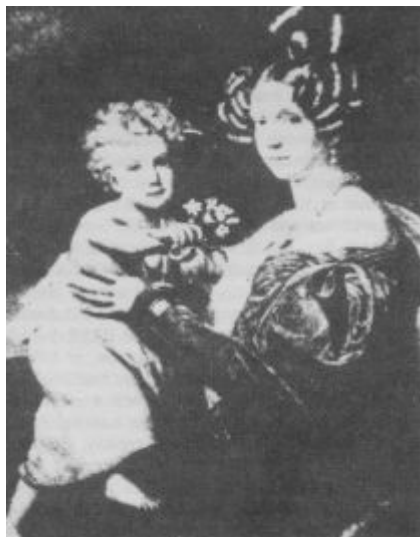
Mother, Archduchess Sophia and brother, Francis Joseph, future emperor.

Continued in Knight Templar February issue