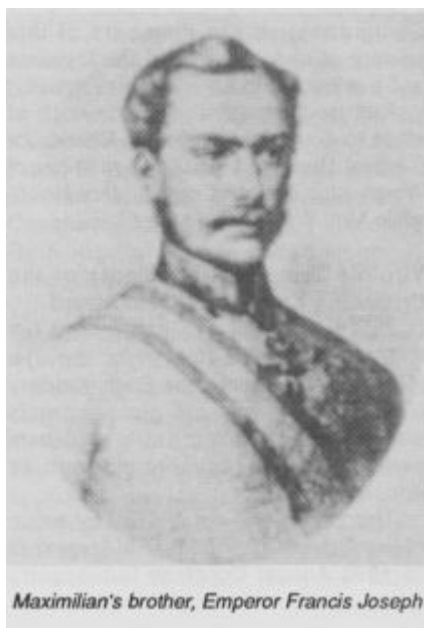
Maximilian's brother, Emperor Francis Joseph