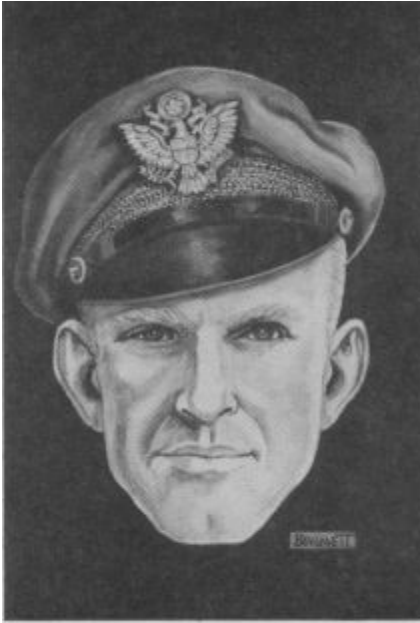
Tex Hill late in WWII