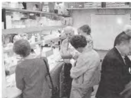
Above right: The attendees were divided into small groups for hands-on laboratory demonstrations and experiments. Here one group is performing an analysis of a DNA protein.