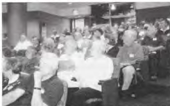
Left: one view of the 115 Sir Knights and their ladies as they eagerly awaited the beginning of the program.

The Knights Templar Eye Foundation, Inc., sponsored an optional special event during the October 2005 North Central Department Conference, which was held in Rochester, Minnesota, and was hosted by the Department of Ophthalmology of the Mayo Medical School.