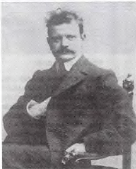
Sibelius as a young man

Johan Julius Christian Sibelius was born on December 8, 1865, in Hameenlinna in the autonomous Grand Duchy of Finland. Sibelius' father was a physician of Swedish and German descent, who died of cholera when "Jahne" was a young man. The family spoke the Swedish language as was very typical for the times. Jahne did not learn his native tongue until he began attending a Finnish school at age eight. By this time the boy was also showing promise in music and could play the piano and the violin. Young Sibelius also learned about the ancient Nordic legends at school. These old tales would later be the inspiration of his earliest masterpieces.