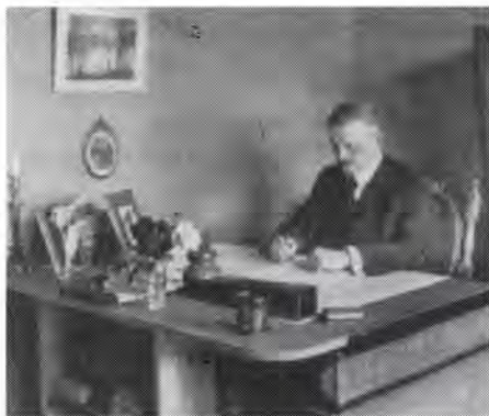
Sibelius at his desk

Greater success followed in 1899 with the premier of the highly nationalistic "Finlandia" as the Russian yoke grew tighter over Finland. The composition was banned but continued to be performed under the false title, "Impromptu."