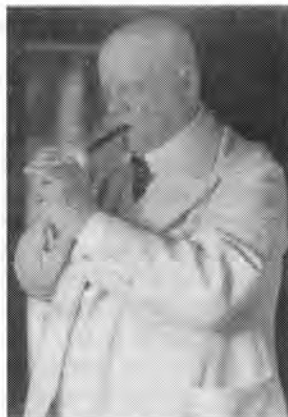
An elderly Sibelius