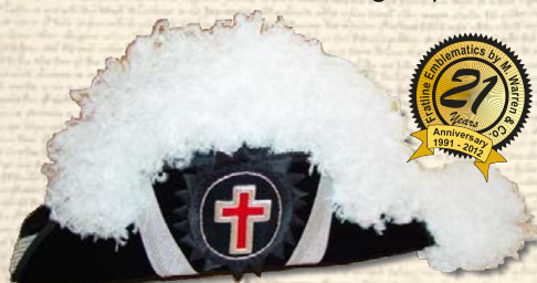
Sir Knight Chapeau Velvet Body w/Ostrich Plume Only $289 + S&H

While at our website, sign-up for our FREE Leadership e-letter.