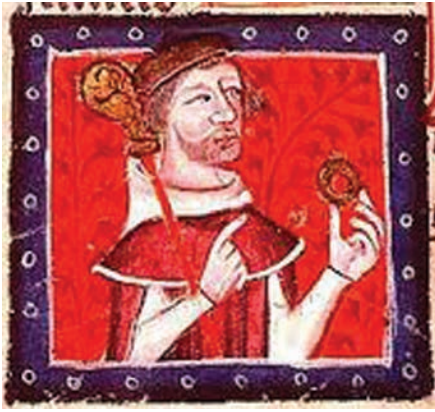
Henry of Blois