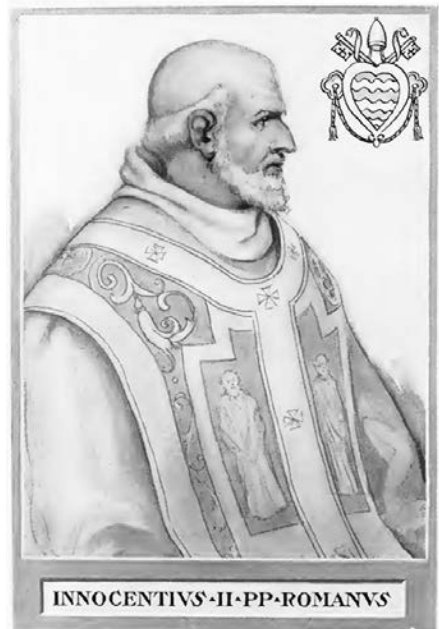
Pope Innocent II

Copies of Hugo Peccator’s letter seem to have been kept with those of the Latin Rule and De laude in some Templar establishments, indicating its importance to the brethren. The publication of De laude by the influential Bernard did mitigate to some extent the suspicion and dislike of certain of the ecclesiastics toward the Templars but by no means completely eliminated it. On the other hand, others voiced their opinions expressing approval of the order and argued for the example of the knights as a separate and vital part of the church hierarchy. Formal Church approval of the Templars at the highest level appeared in 1139 with the issuance of the bull Omne Datum Optimum by Pope Innocent II that endorsed the Order of the Poor Knights of Christ and of the Temple of Solomon, in which the Templar Rule was officially approved and papal protection given. Additionally, the bull promised all spoils from Muslim conquest to the order, and made the order exempt from tithes and taxes. Further, it freed the Templars from all ecclesiastical authority except that of the Pope. This important bull clearly gave the Templars a significantly greater scope of action, a