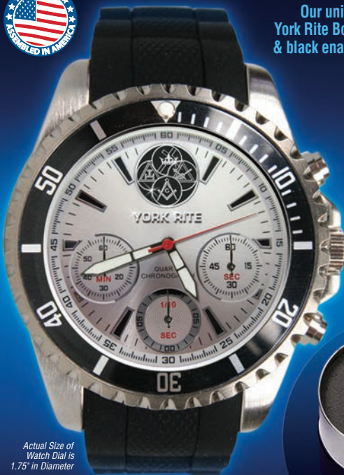
Actual Size of Watch Dial is 1.75" in Diameter

YOU HAVE EARNED THE RIGHT TO OWN THIS YORK RITE CHRONOGRAPH WATCH