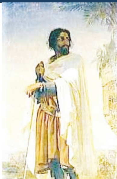
Hugues de Payens

Although the Templars had obtained approval within Christendom, more or less, by the middle of the twelfth century, before this time they were not enthusiastically welcomed by several of those within and without the organized Church. To better understand this attitude of aversion, during the tenth and eleventh centuries the Church, starting under Pope Gregory VII, had undergone a series of reforms which had led to the establishment of monastic houses such as Cluny and Clairvaux. These reformers stressed spiritual purity unspoiled by political influences and especially bloodshed. They sought to maintain a distinct distance between earthly and