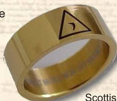
Scottish Rite 14th Degree Ring Stainless Steel Only $49.95