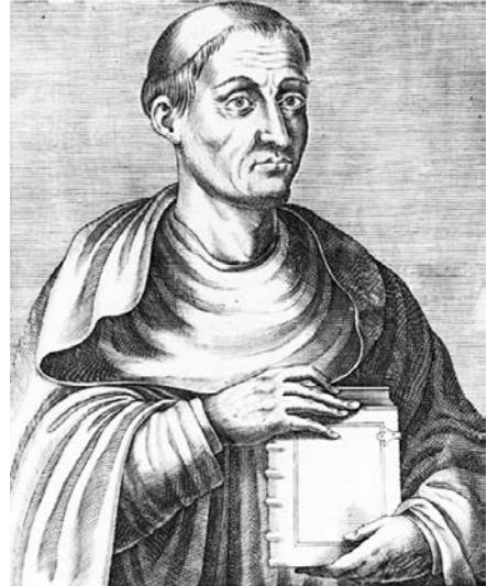
Hugh of St. Victor

He further admonished the Templars to go about their ordained task in a tranquil frame of mind, like true servants of God; he promised that God had not abandoned them, and if their worth was