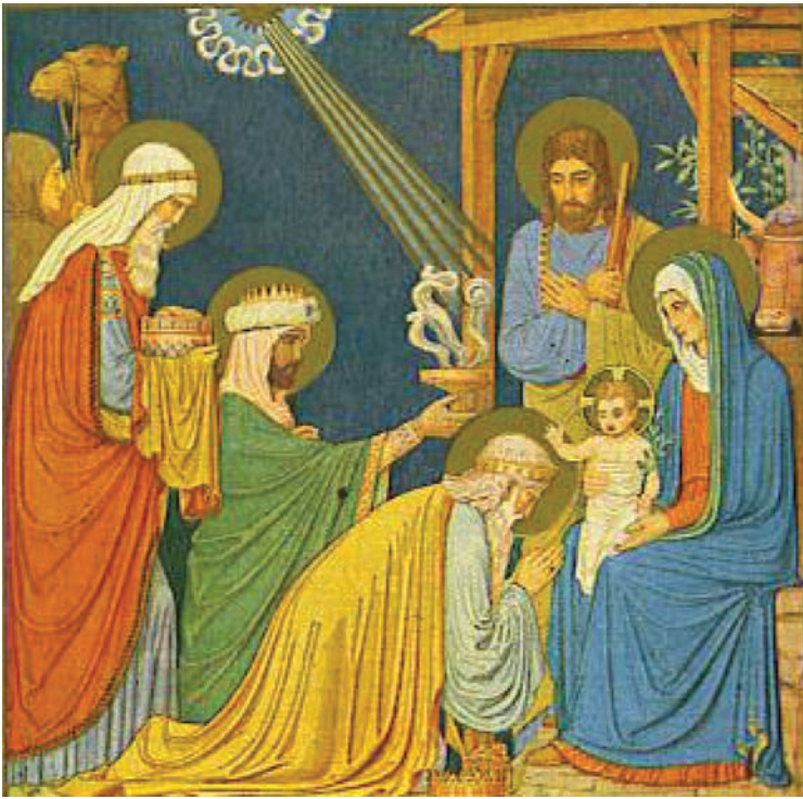
The Three Kings and the Holy Family

Bethlehem of Judea: for thus it is written by the prophet, and thou Bethlehem, in the land of Judah, art not the least among the princes of Judah: for out of thee shall come a governor, that shall rule my people Israel.