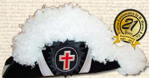
Sir Knight Chapeau Velvet Body w/Ostrich Plume Only $289 + S&H

While at our website, sign-up for our FREE Leadership e-letter.