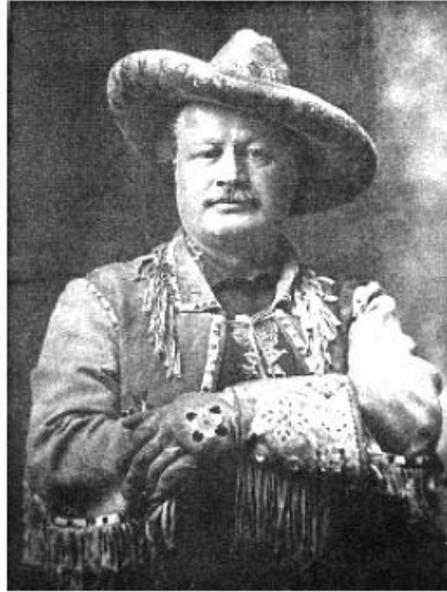
Pawnee Bill, ca. 1900