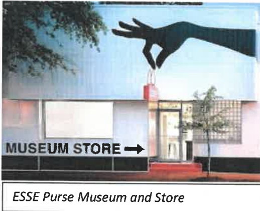
ESSE Purse Museum and Store

We're going to have a great day Friday, September 20th, starting with meeting in the lobby of the hotel at 10:00 am where we will be chauffeured to ESSE Purse Museum and Shop. So be sure to eat a good breakfast and wear comfortable shoes.