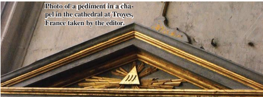
Photo of a pediment in a chapel in the cathedral at Troyes, France taken by the editor.