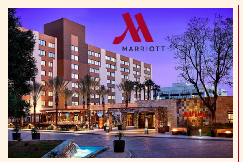
Los Angeles Marriott Burbank Airport