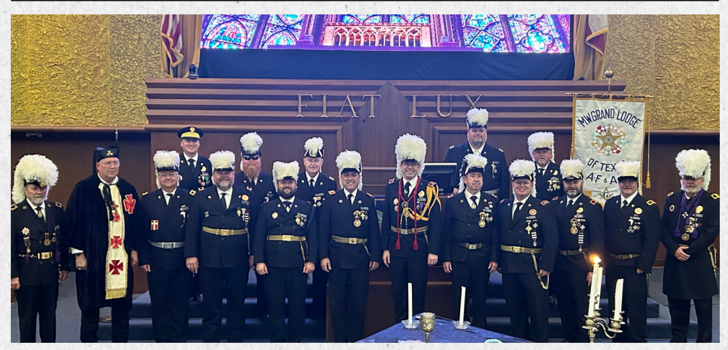
Grand Commandery of Texas Good Friday Observance (Waco, Texas)