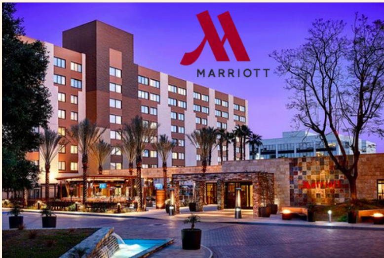
Los Angeles Marriott Burbank Airport