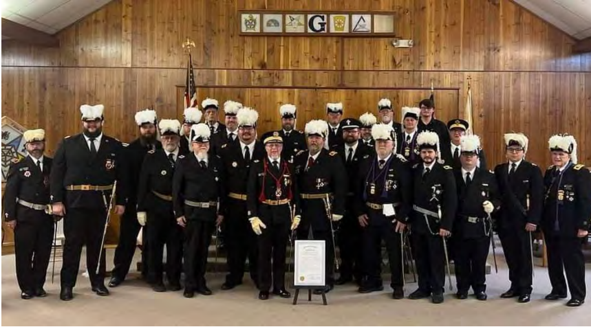
Left: The newly installed officers and Sir Knights in attendance for the constitution and consecration of Appalachia Commandery #45 in Fountain City (Knoxville) on April 13, 2024. Including guests and visitors there were over sixty people in attendance.