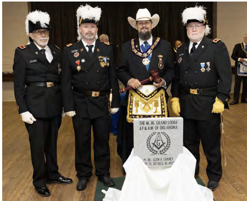
Three outstanding Knights assisting the Grand Lodge Cornerstone at Apache, representing the Oklahoma Knights Templar, in our Quest for the recognition of our most excellent Christian Brotherhood.