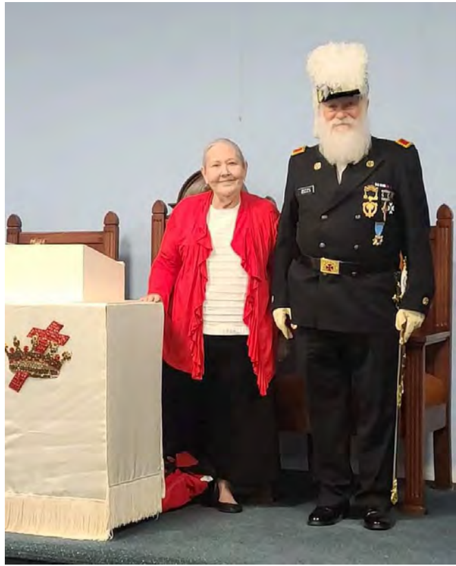
My first Official Visit was to the Beauceant This is a outstanding Ladies Group that supports the Commanderies. Talk to your wives, daughters etc. let us support this good Christian organization.