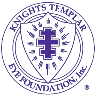
"A Masonic Charity"