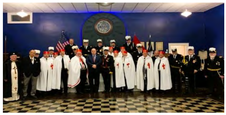
PARK AVE #31 ROSEMARK #39