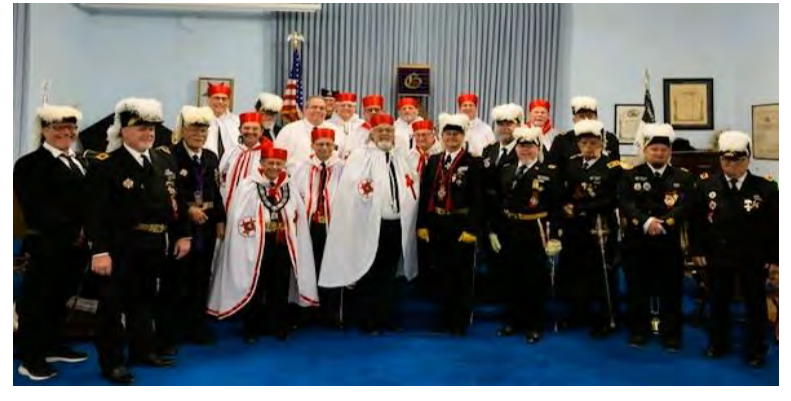
DE PAYENS #11