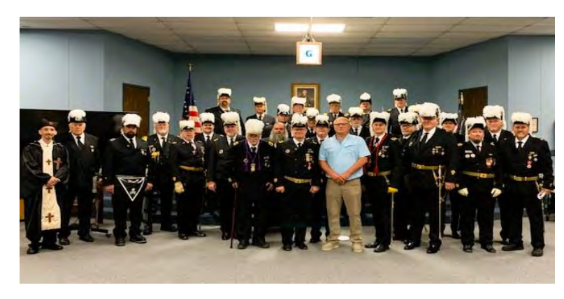
JACKSON #13 UNION CITY #29 LEXINGTON #36