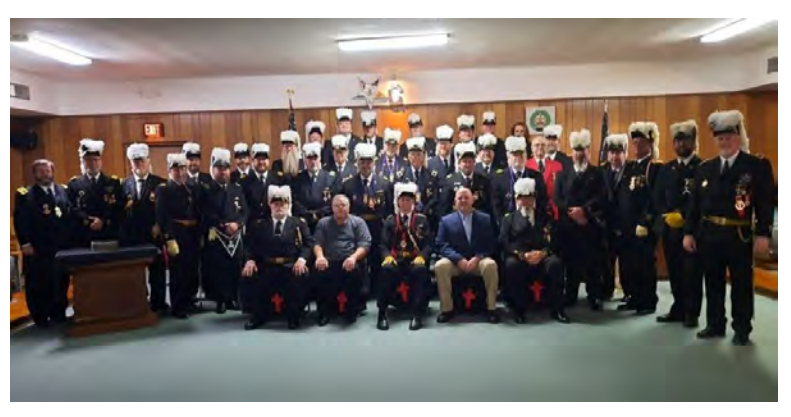
CHEVALIER #21 CAMPBELL CO #44