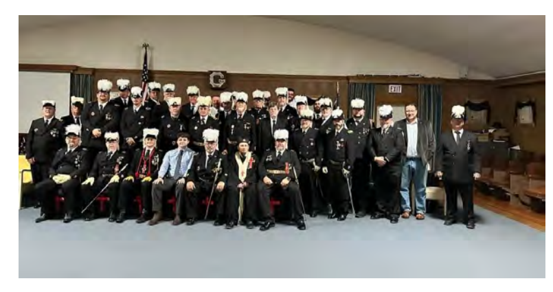
KINGSPORT #33 ST OMER #19 WATAUGA #25