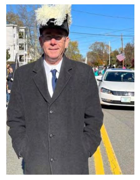
The Right Eminent Grand Commander and the Sir Knights. in formation, preparing to step off.